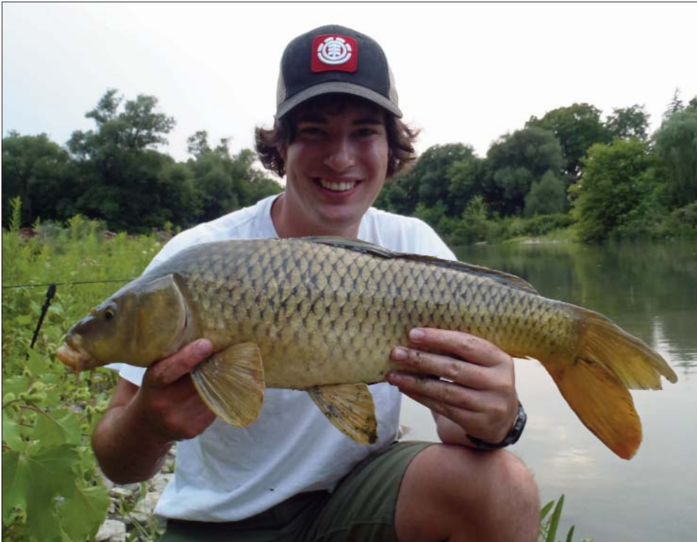
Carp can grow to be very large in the Grand River and other waterways and reservoirs, but they have a detrimental impact on the ecology. Many people enjoy carp fishing.