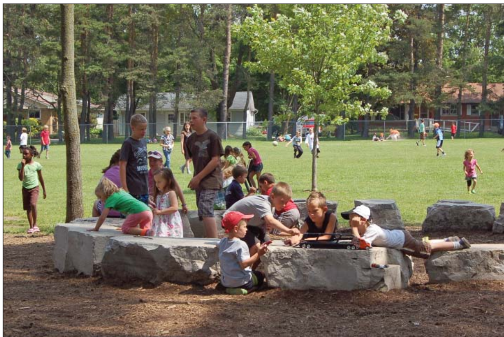
Children playing at recess in the outdoor classroom at Arthur Public School.

Each student in the school received a tree seedling thanks to Copernicus Educational Products, an educational products company. Students also planted seedlings in a small